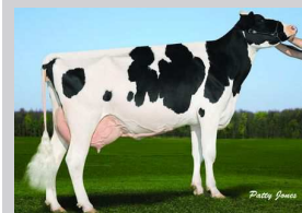
Loa-De-Mede Timber Jamie 2009